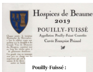
Pouilly-Fuissé : pleasure and concentration