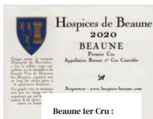
Beaune 1er Cru : elegant and complex