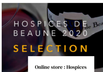
Online store : Hospices auction from 1 bottle