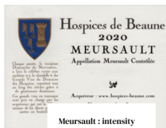
Meursault : intensity and precision