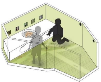
Sketches ©BIVB / Studio Adeline Rispal