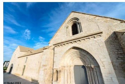
Léproserie de Meursault

The recently-renovated Léproserie de Meursault , will host the “Trinquée de Meursault” tasting. The Château de Gilly-les-Cîteaux , will be home to the “Quatuor en Harmonie” tasting of wines from the Nuits-Saint-Georges, Chambolle-Musigny, Morey-Saint-Denis, and Vougeot appellations. A tasting of organic wines will be on offer in Rully .