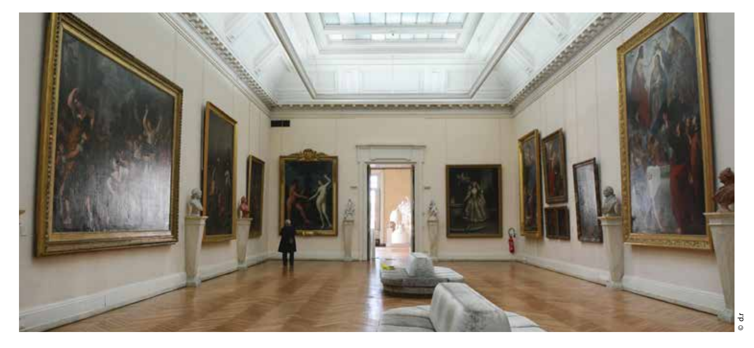
5.3.1. Presentation of the Musée des Beaux-arts

Information: http://mba.dijon.fr - +33 (0)3 80 74 52 09