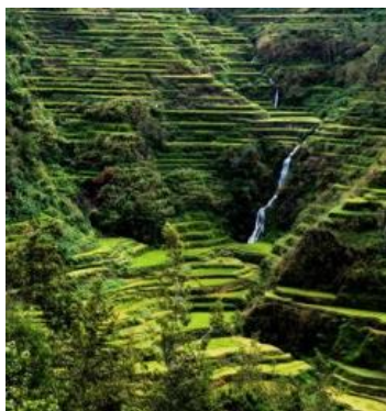
Rice Terraces of Ifugao (Philippine Cordilleras)