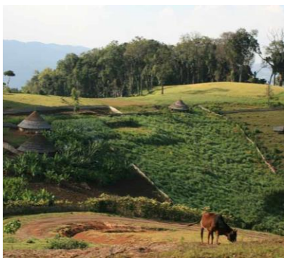
Kafa Biosphere Reserve (Ethiopia)