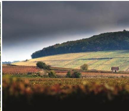
Climats of Burgundy vineyards (France)